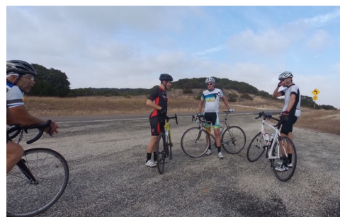
Another trip to Ranger Peak