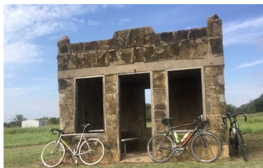
Can you name the place?