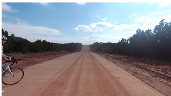
Mike checking out a new road off of CR150