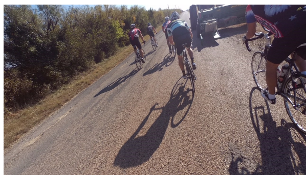
Drafting behind a tractor on CR127!