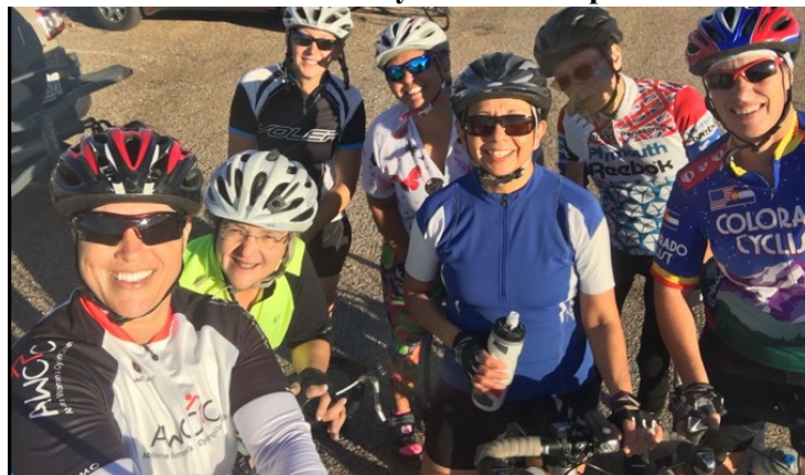
AWACC group out for a ride!